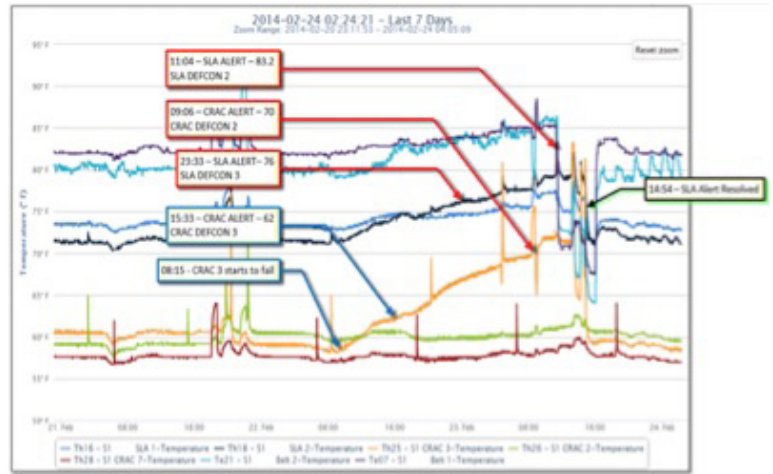
Shortly after deployment, RF Code's real-time dashboards helped Digital Fortress detect a leaking CRAC unit before it completely failed

During both phases of the deployment process Digital Fortress used RF Code's Asset Manager Mobile to troubleshoot sensor and reader placement, ensuring the best possible read ranges and visibility were achieved. Once the sensor network was in place, Digital Fortress began building customized dashboards using the Asset Manager platform.