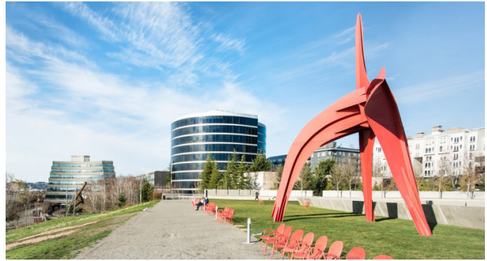
Digital Fortress's downtown Seattle data center.

Digital Fortress discovered RF Code at the end of their search and quickly realized that it was going to meet all their needs.